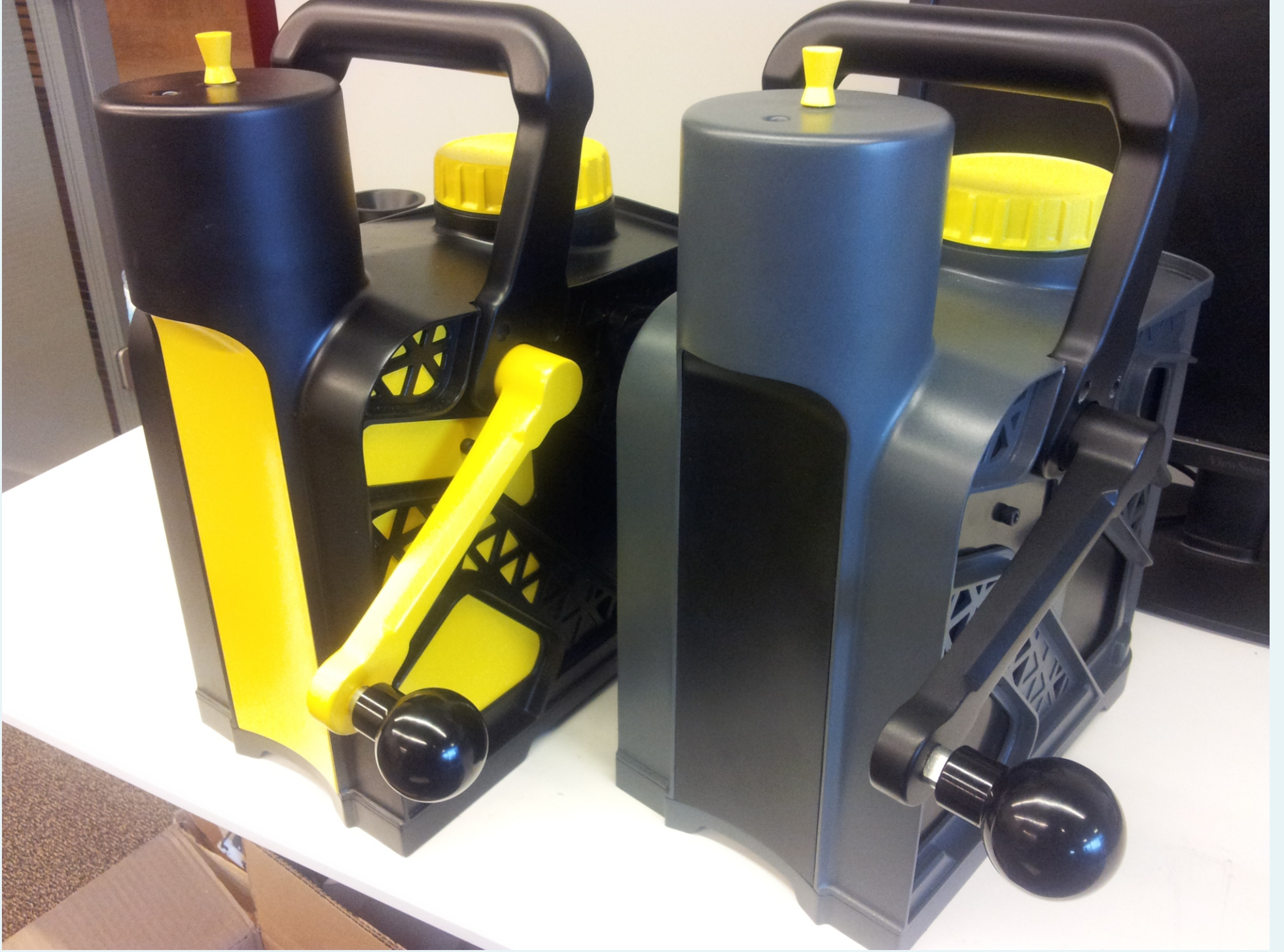
THE WATER ELEPHANT